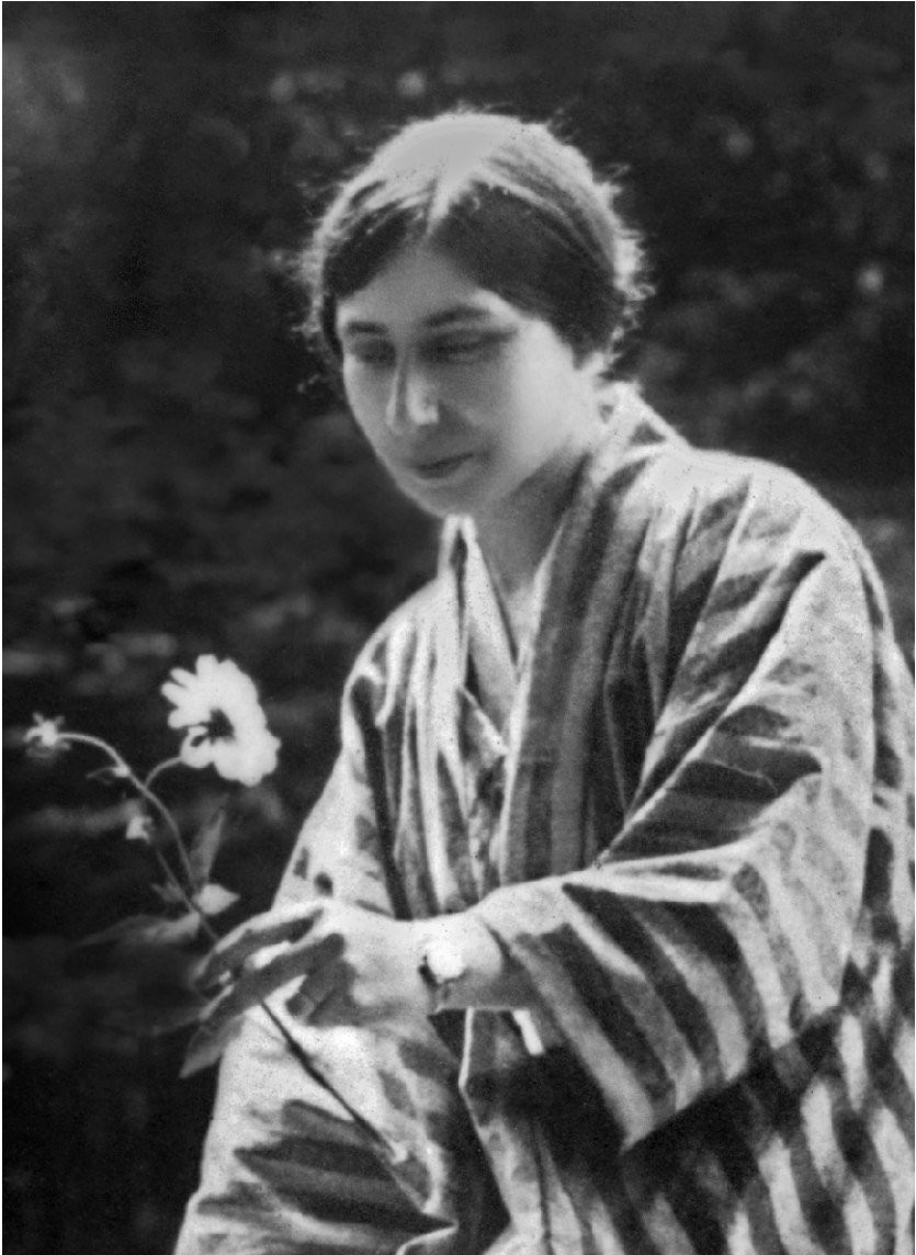
The Mother in Tokyo, 1916