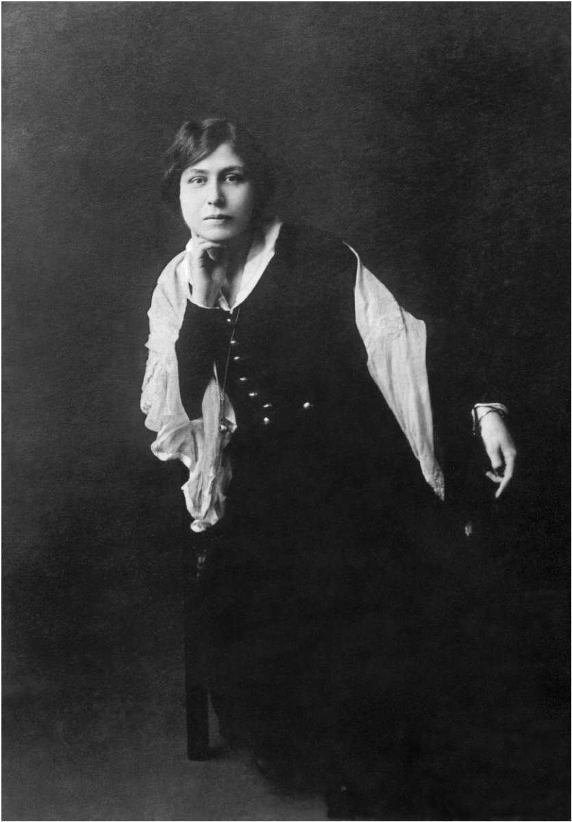
The Mother in Tokyo, 1917