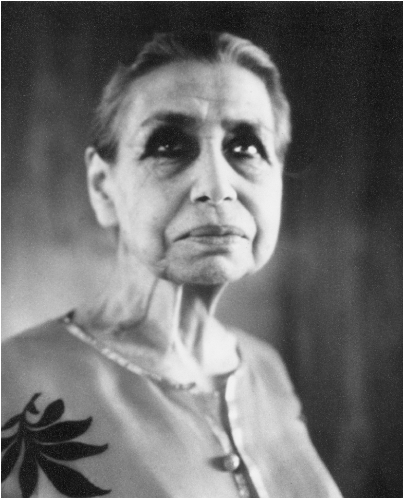
The Mother - 1960