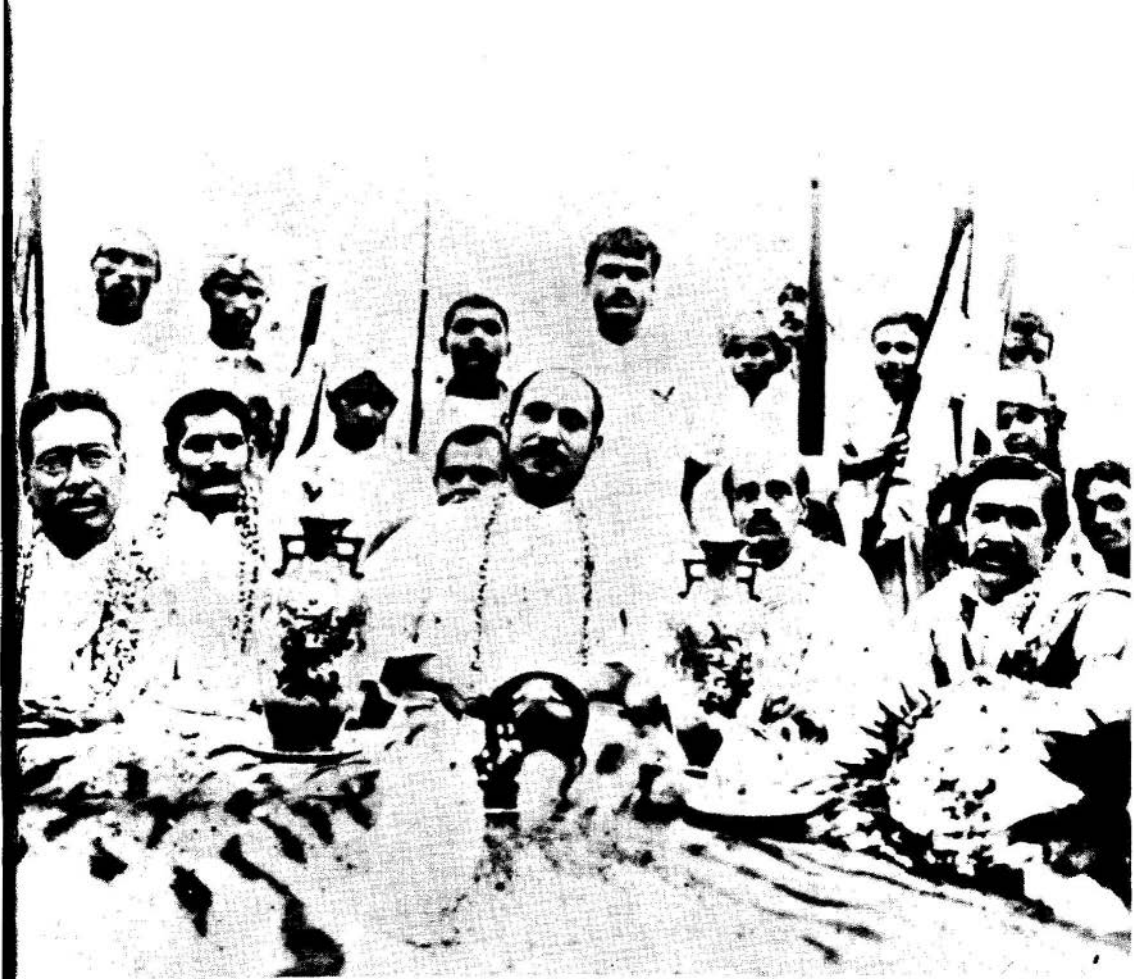
Sri Aurobindo (extreme right) at Uttarpara on the occasion of his historic speech