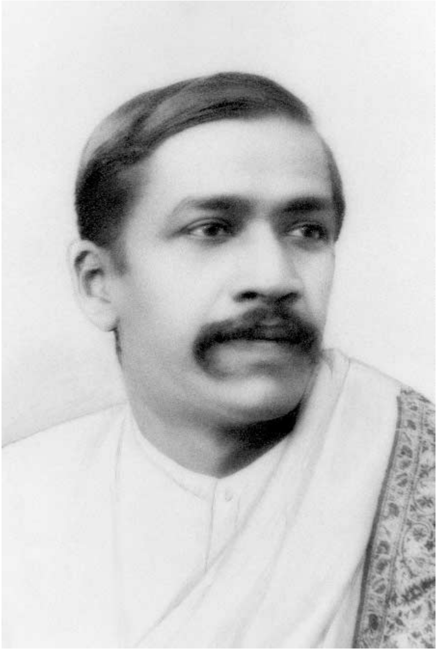
Sri Aurobindo in 1908