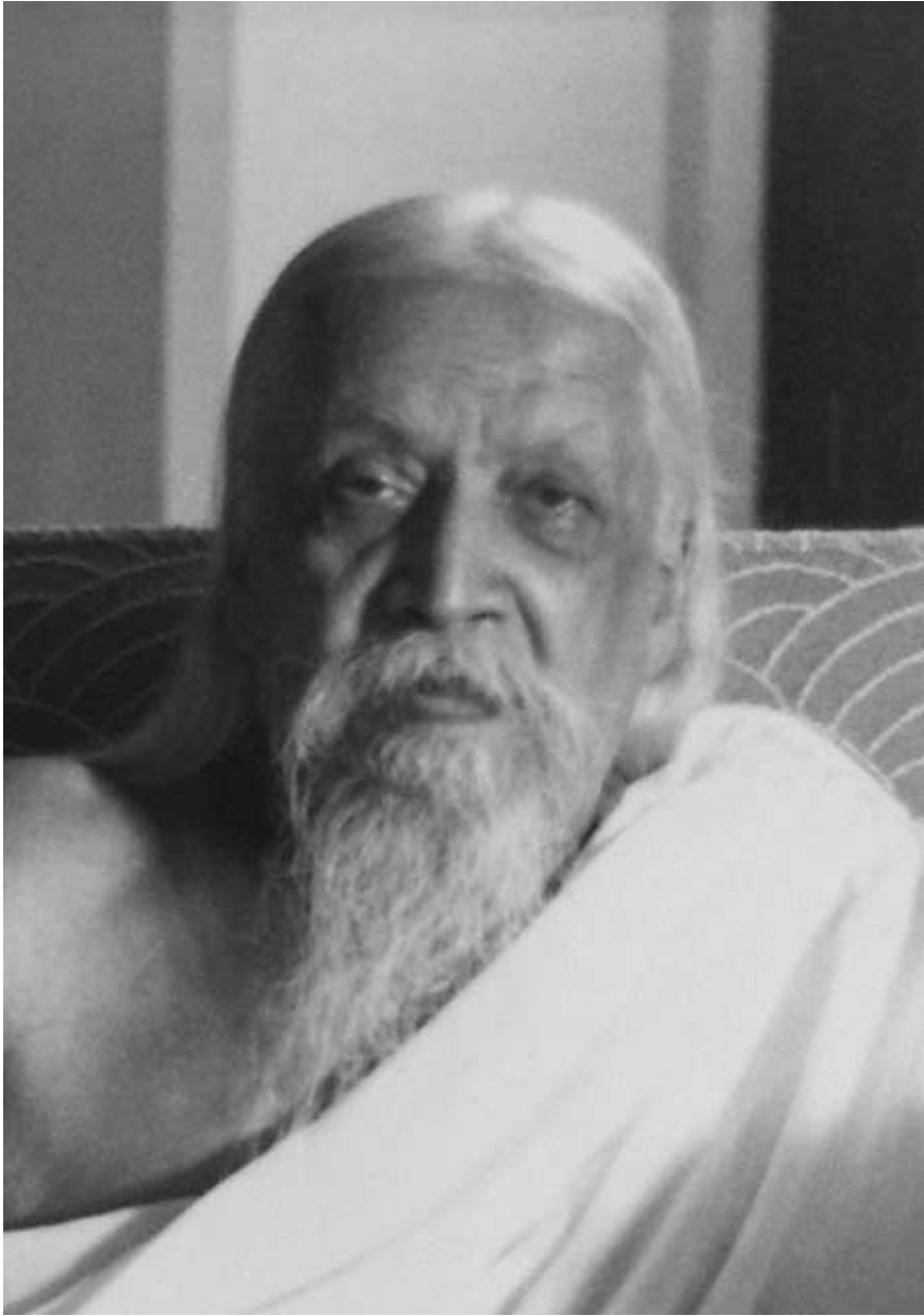
Sri Aurobindo in 1950