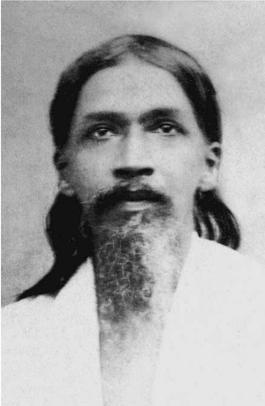
Sri Aurobindo in Pondicherry, c. 1915-1918